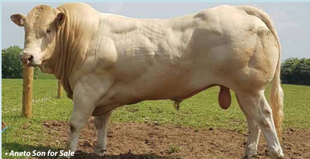
• Aneto Son for Sale