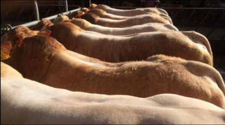
Pictures of a selection of this years young halter trained bulls. Well muscled, easy calved and exceptionally quiet bulls.