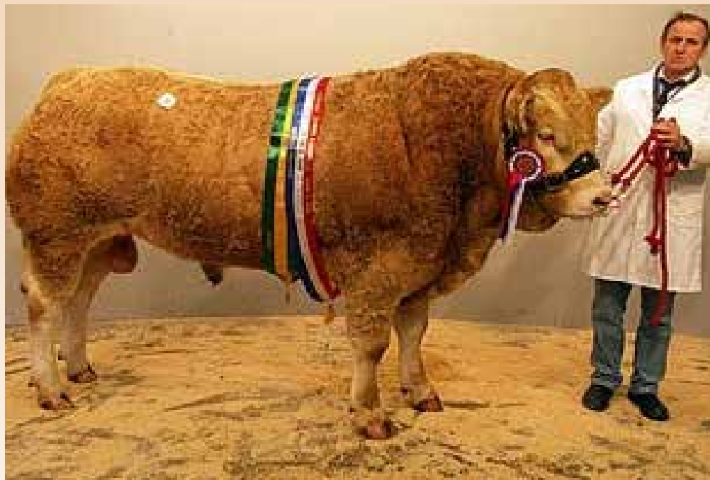
• Jet x Fronfedw Medwin • Ai code s984