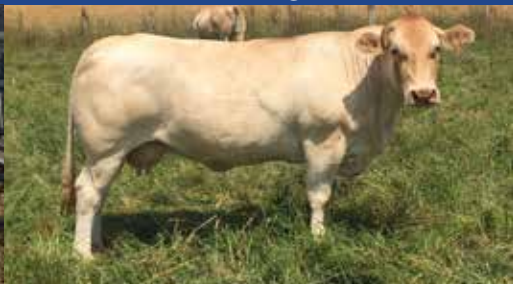
• Carbel Daughter