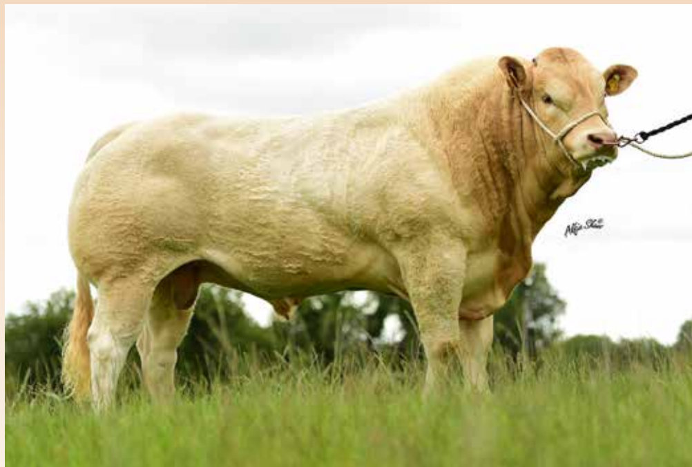
Seaview Barney x Shanvalley Dancer • Ai code BA2308