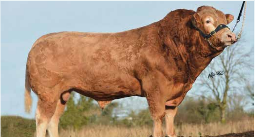
Carmels senior stock bull Clondown Eddie

The reason Carmel started to use Blondes was for calving ease, but also the versatility of the breed, she can sell weanlings, finish or keep as replacements.