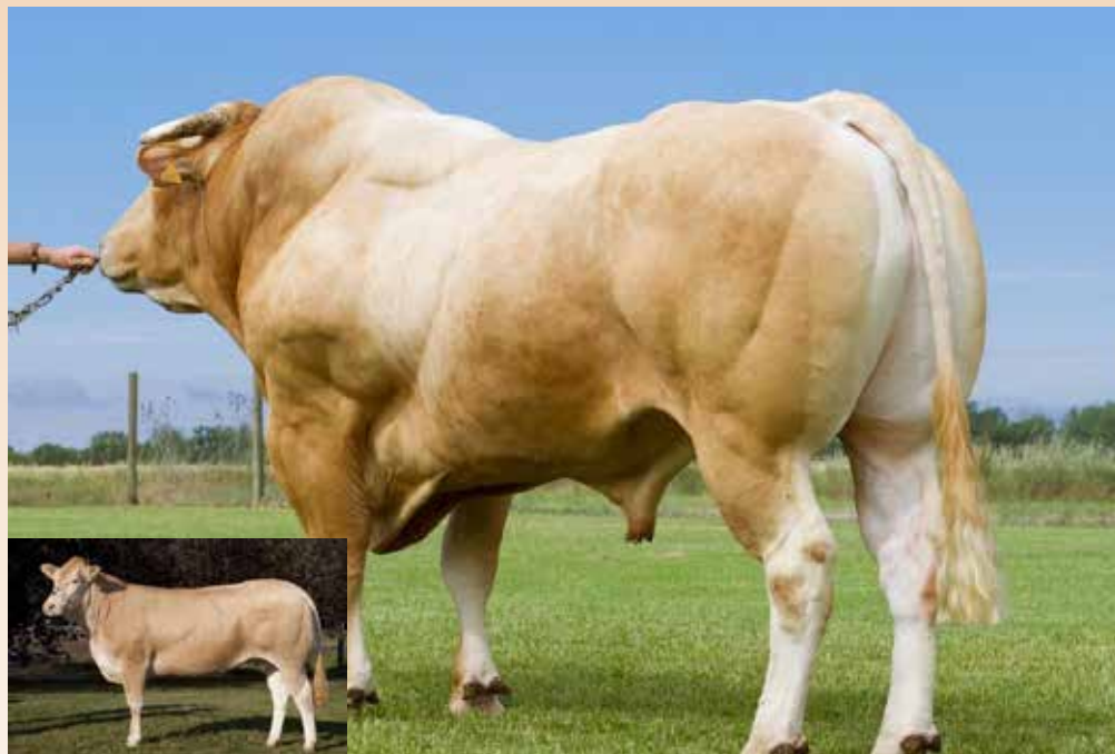
• Leo (Crack) x Inedit • Ai code BA 2139