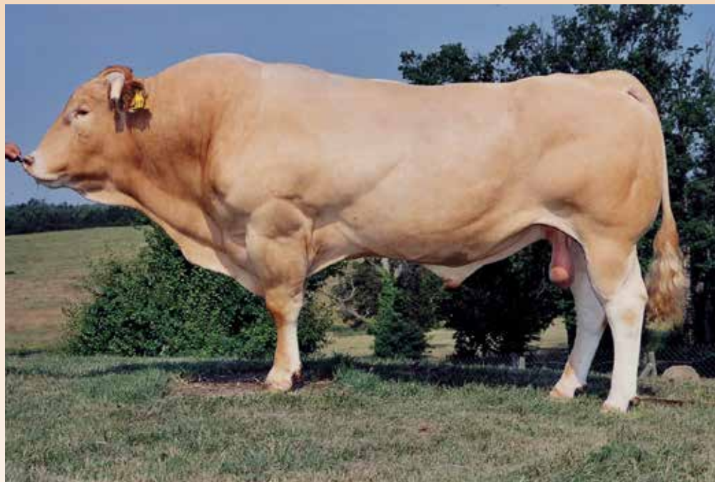
• Iholdy x Golfe • Ai code S757