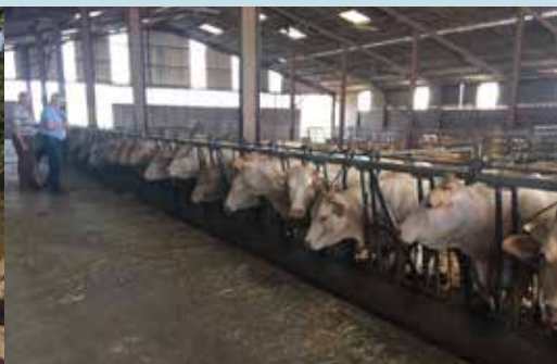
• Blonde cows housed in June