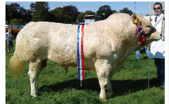
Inzagi's sire - Seaview Barney