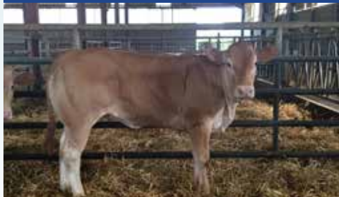
• Aramis Daughter