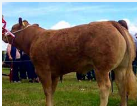
Golden Heifer at The Ossory Show