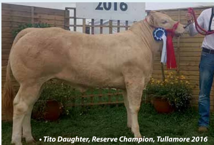
• Tito Daughter, Reserve Champion, Tullamore 2016

• Bulls for Sale • Heifers occasionally for sale • Top AI Sires used: Aneto, Tito