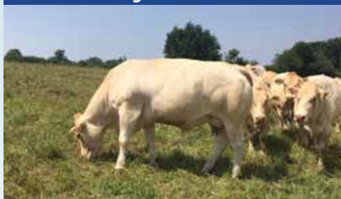
• Aramis Cows