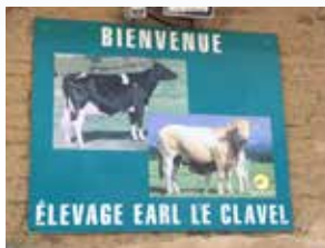
• Required Signage on French Farms