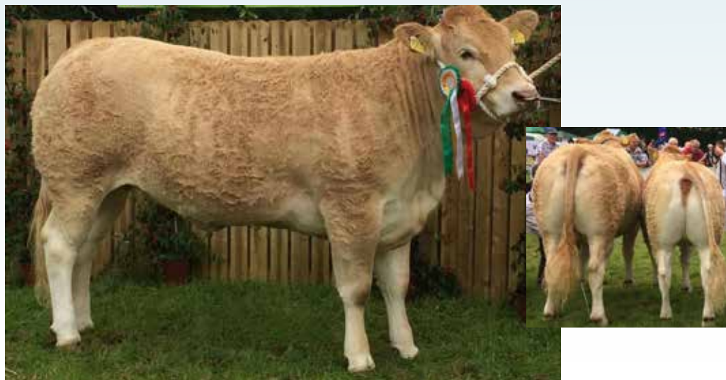
Glenwood jo jo Heifer class winner at Piltown