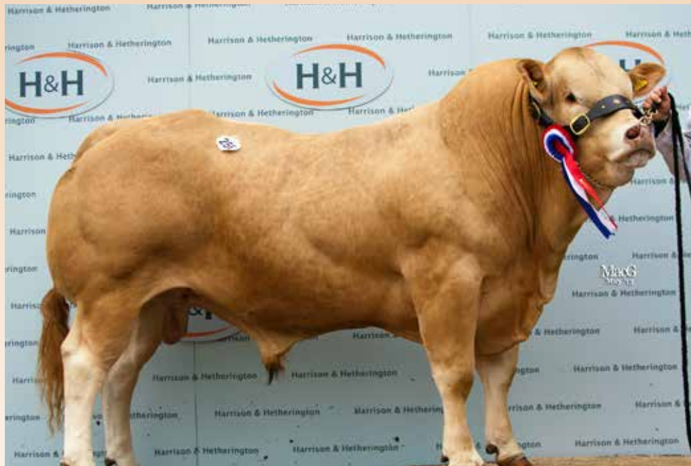
• Ballygowan Noble x Whistley Dollar • Ai code S2178