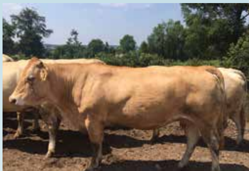
• Angelo Cows