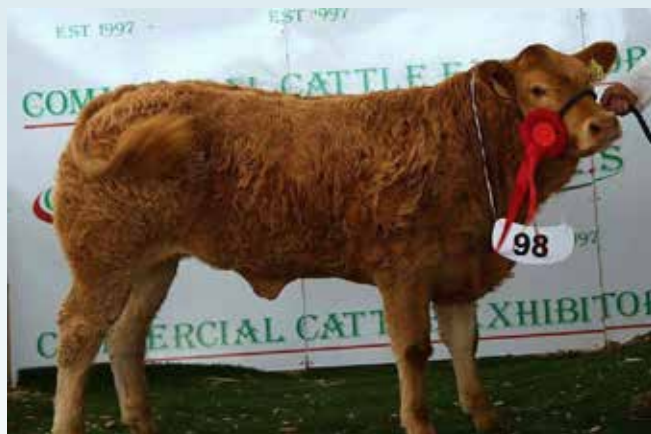
First prize winner in Roscommon Winter Fair sired by Brockagh Eddie